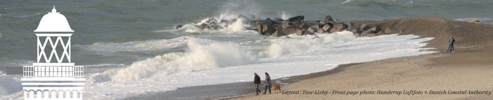
Layout: Tove Lisby